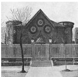
Synagogue in Odessa

In response to the Russian invasion of Ukraine, The Jewish Federations of North America have launched a $27 million emergency campaign to provide humanitarian assistance to vulnerable Jewish populations living in Ukraine.